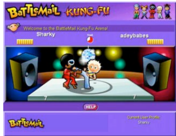
Figure 2 - The BattleMail Kung-Fu interface

download the game if necessary, then input his own defense and attack moves, and both players would watch the animated outcome in the game interface. There was no strategy in the game — it was just a Ro-Sham-Bo of chance moves: attack (or defend) high, middle, or low. If you chose to attack high and your opponent defended low, you'd score a hit.