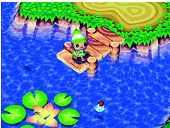
Figure 6 - A player goes fishing in Animal Crossing

One of the achievements of asynchronous multiplay in The One was its careful integration of gameplay into the real lives of players. Most Palm handheld owners are professionals with busy schedules who might only find value in a game during the breaks in their workdays. While mobile devices and phones are more likely to offer Bluetooth or WiFi connectivity now than in 2001 when The One was released, such synchronous play-enabling technologies still ask players to spend time finding likely candidates for multiplayer games, in physical proximity to them and with similar time horizons for single game sessions. Such scenarios may sound plausible among close-knit early-adopters of game technology, but for casual players, multiplayer games need to accommodate the player's schedule, not vice-versa.