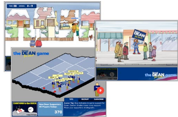
Figure 7 - Screens from The Howard Dean for Iowa Game . The bottom left screenshot shows different levels of virtual support (shades of blue) based on aggregate, asynchronous player activity

most out of Animal Crossing , players need the patience to persist.