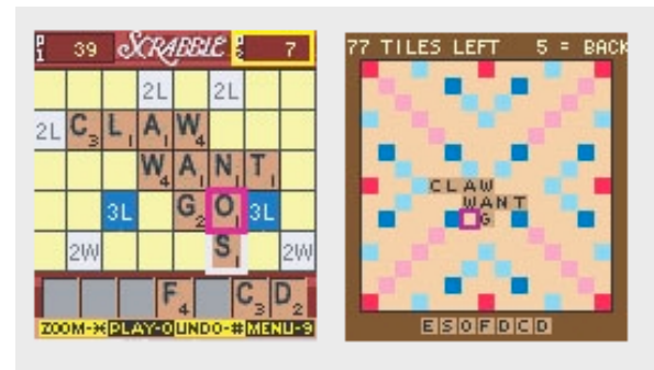
Figure 5 - Screens from Imagine Engine / Jamdat's mobile phone rendition of the classic boardgame Scrabble .

The mobile version of the game is simple enough. In its basic mode, the game offers a single-player mode that uses a common Scrabble AI algorithm. But the multiplayer mode merges Battle Mail -style PBeM play with The One 's approach to natural downtime. In head-to-head mode, players cast their move, then drop the phone in a pocket or purse and proceed with their usual routine.