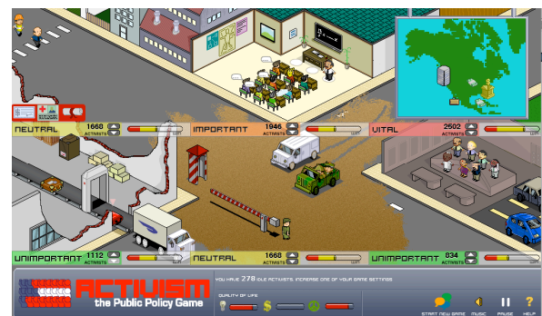
Figure 8 - Activism: The Public Policy Game . The colored bars show a player's allocations of activists, and thereby the relative importance of each policy issue.

In a more recent political game, I tried to apply this lesson. Activism: The Public Policy Game (Persuasive Games 2004) is an attempt at a game-based public policy polling tool. Players allocate activists between six minigames representing as many US domestic and foreign policy issues (the economy, education, corporate policy, security, the military, and internationalism). Players then allocated activists between the issues and played all the games simultaneously. The gameplay changed based on the relative importance of one issue over another. Players could change these settings continuously during the game.