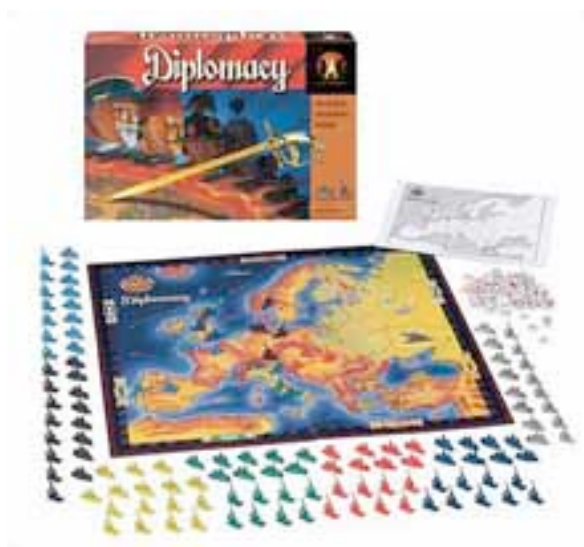
Figure 1 – Diplomacy ® was first sold in 1959 and is currently published by Hasbro®

Each player controls one of the powers of pre-WWI Europe. Instead of taking turns moving players, all players submit moves for their units — armies and fleets — at the same time. Between turns, players are encouraged to establish or betray partnerships and agreements. Because each power has different strengths and weaknesses, the game relies on negotiation and intrigue. Immensely popular among strategy game buffs, legend has it that Diplomacy was the favorite game of both John F. Kennedy and Henry Kissinger.